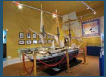
Scale model of the Endurance in Athy Heritage Centre - Museum