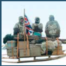
Antarctic Adventurers appearing during the Shackleton Autumn School